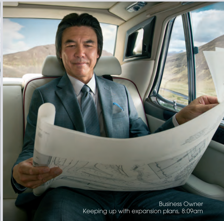
Business Owner Keeping up with expansion plans, 8:09am

When it comes to your wealth, we manage it as you would.