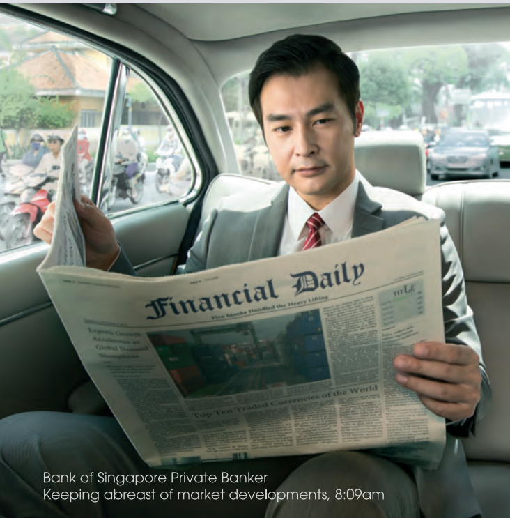
Bank of Singapore Private Banker Keeping abreast of market developments, 8:09am

Like you, we believe success doesn't arrive by taking a back seat.